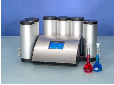
Picture 1: The MultiScan MS 20 dispersion stability analysis system can now perform measurements at sub-zero temperatures down to -10 °C.