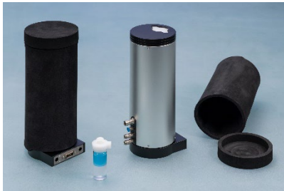
Picture 2: The insulation sleeves are easy to handle: they only need to be slipped over the sample chambers of the MultiScan MS 20.